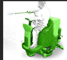
Spraying lance from operator position